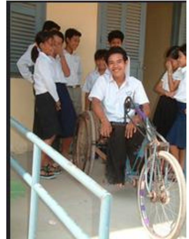
"Man Ty's wheelchair"