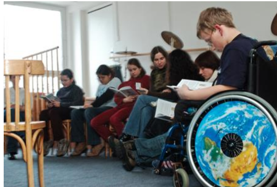
"Students read in a classroom" by World Bank Photo Collection is licensed under CC BY-NC-ND 2.0