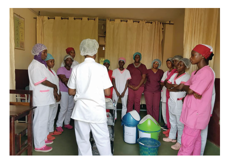
Meeting of health center staff

essential and integrated care package, guiding health service delivery and training at all levels of care.